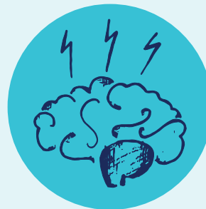
Engineering design process